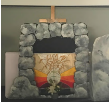
Women's Retreat - Nunyara Conference Centre, Belair July 2-4 2021