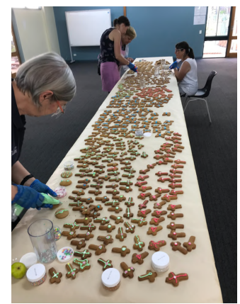
Easter Services - April 2021