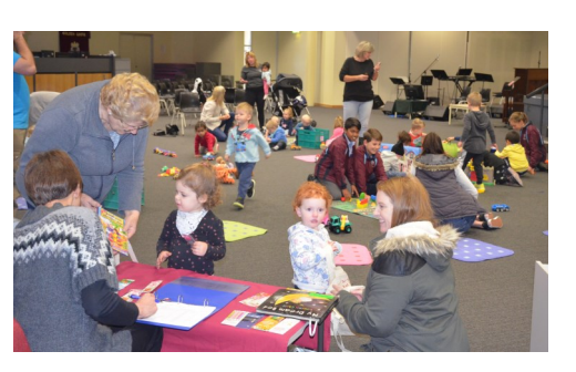
New Playgroup Page 16