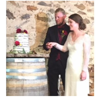
Youth Worker Marries Page 9