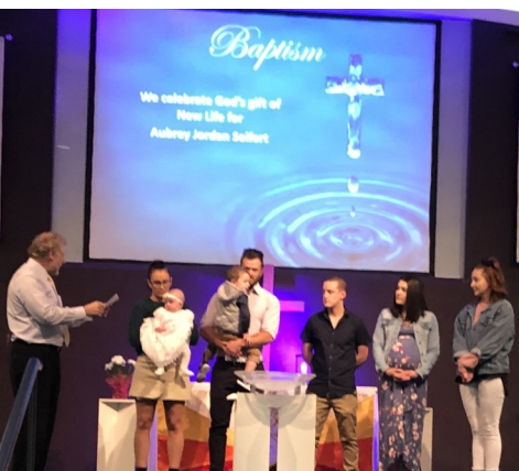
Let us daily die to sin, let us daily rise with him walk in the love of Christ our Lord, live in the peace of God.

2. In the water, in the word, in his promise be assured: who are baptised and believe shall be born again.