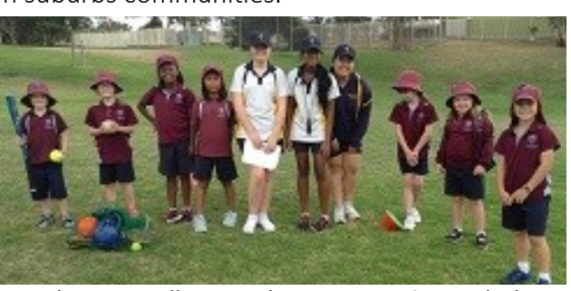
Endeavour college students connecting with the primary school children through sport .