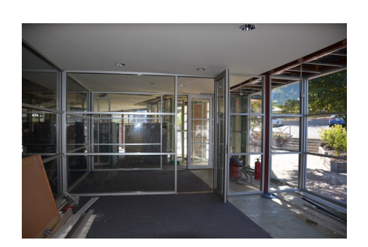
Church Council News Page 4