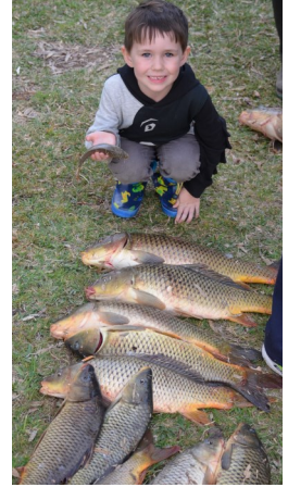
GGAF Page 5